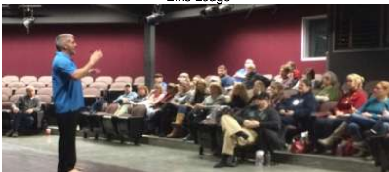
Chico High School

The trainings were well attended and many employees actively engaged the speaker in lively discussions regarding student behaviors and the challenges that they faced at work.