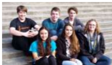
Honor Band and Honor Choir Students from Chico High